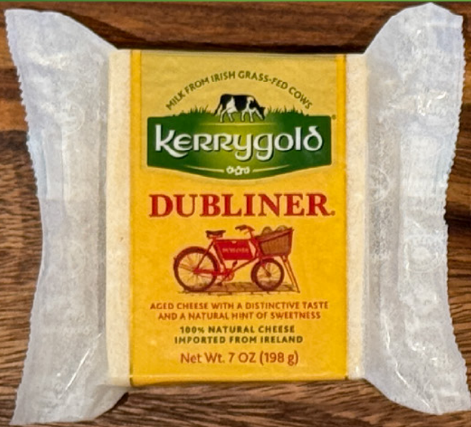
Kerrygold Dubliner Irish Cheese