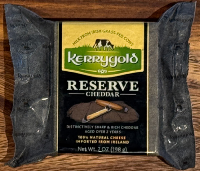
Kerrygold Reserve Cheddar Irish Cheese