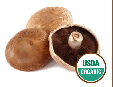
ORGANIC Portabella Mushrooms Oregon