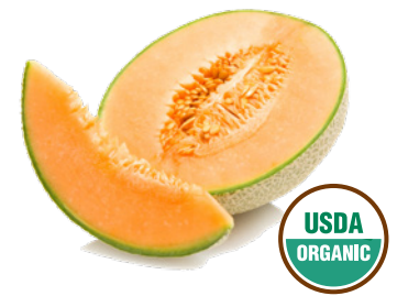
ORGANIC Cantaloupe California