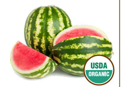
ORGANIC Seedless Watermelon California