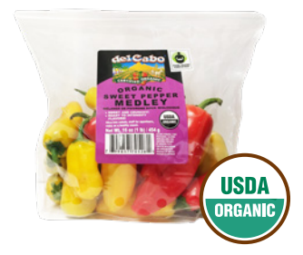
ORGANIC Mini Sweet Peppers Mexico