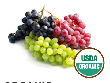
ORGANIC Seedless Grapes Red • Green • Black