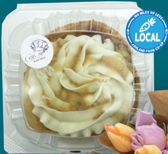
CURLY TOP BAKESHOP Baked Goods