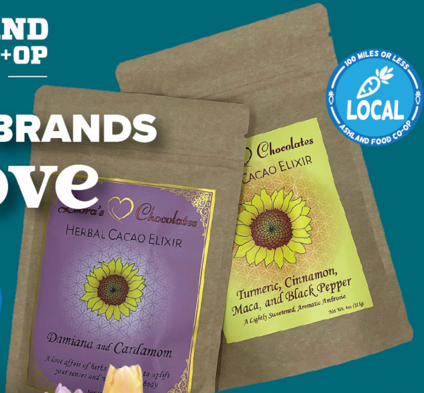
LEORA'S CHOCOLATES Herbal Cacao Elixir 4 oz.