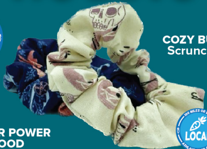
COZY BUNS Scrunchies