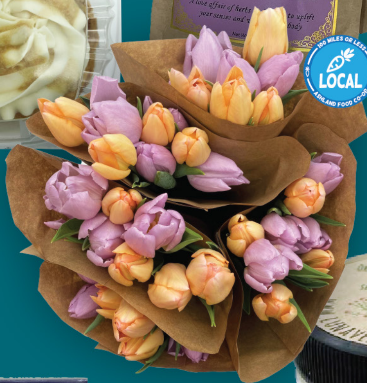
FLORA FARMS Tulips