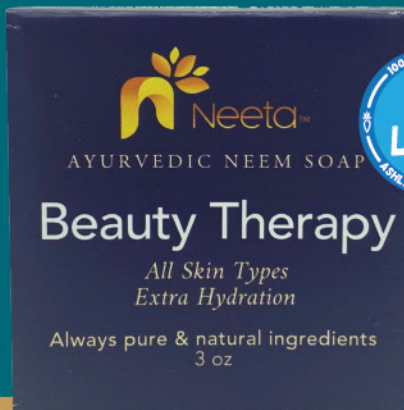
NEETA NATURALS Neem Soap 3 oz.