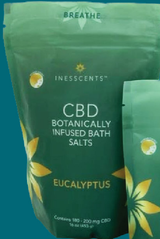
INESSCENTS Eucalyptus Bath Salts