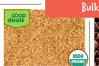
ORGANIC Golden Flax Seeds