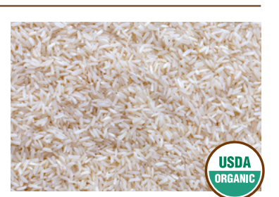
Lundberg Family Farms Organic Long Grain White Rice