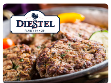
Diestel Turkey Ranch Ground Dark Turkey