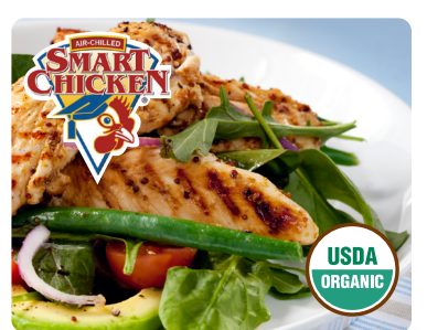
Organic Smart Chicken Tenderloins