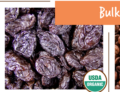
ORGANIC Pitted Prunes