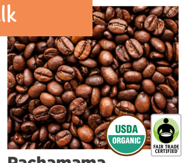
Pachamama Organic Peru Medium Roast Coffee