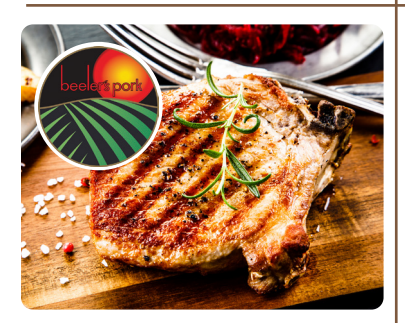
Beeler's Bone-in Pork Chops