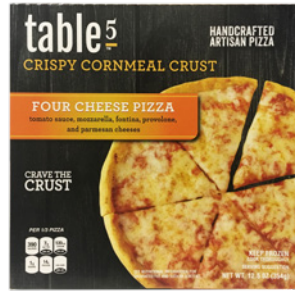
Table 5 Cornmeal Crust Pizza