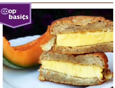
Co-op Kitchen Hot Grab-n-Go Egg & Cheese Break-fast Sandwich