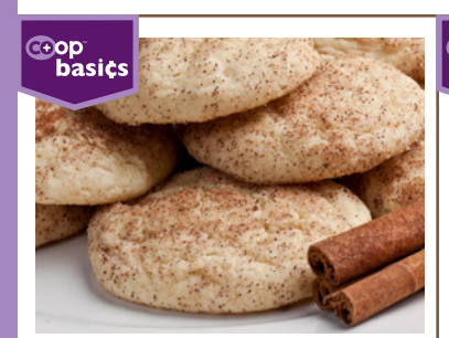
Co-op Bakery Snickerdoodle Cookie