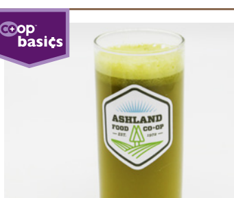
Co-op Kitchen Made to Order Keep It Simple Juice