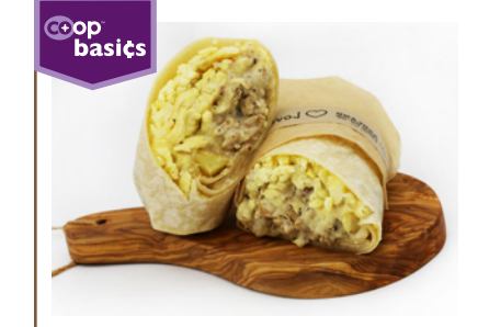
Co-op Kitchen Made to Order PCT Breakfast Burrito