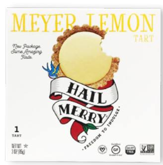
Hail Merry Tarts