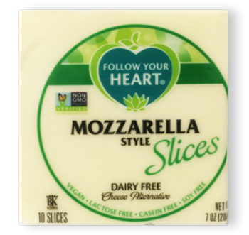
Follow Your Heart Dairy Free Sliced Cheese 7 oz.