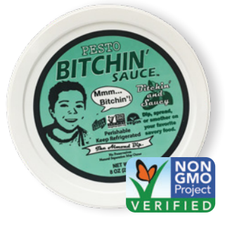
Bitchin' Sauce 8 oz.