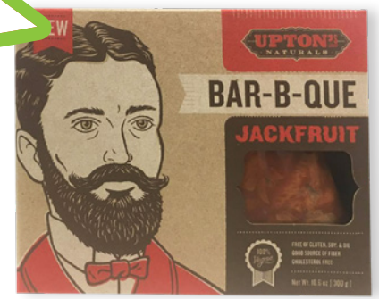
Upton's Naturals Bar-b-Que Jackfruit 10.6 oz.