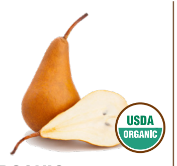
ORGANIC Bosc Pears Washington