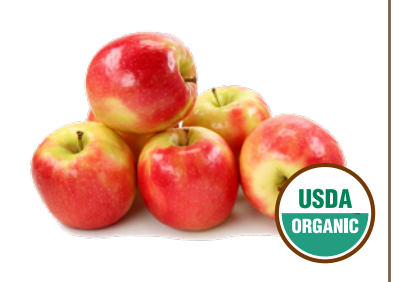
ORGANIC Pink Lady Apples Washington