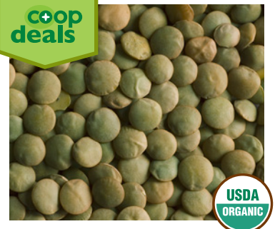
ORGANIC Green Lentils