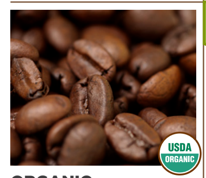
ORGANIC Café Mam Tango Coffee