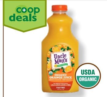
Uncle Matt's Organic Orange Juice