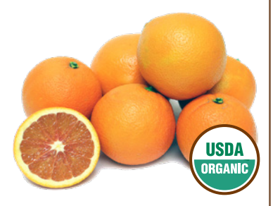
ORGANIC Cara Cara Navel Oranges California