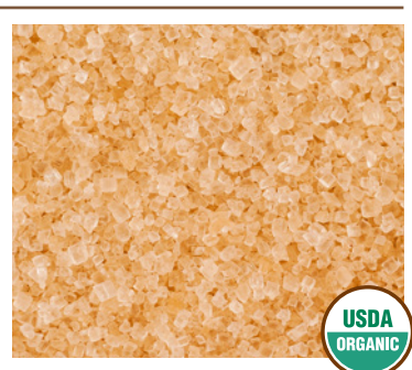
ORGANIC Cane Sugar Unrefined